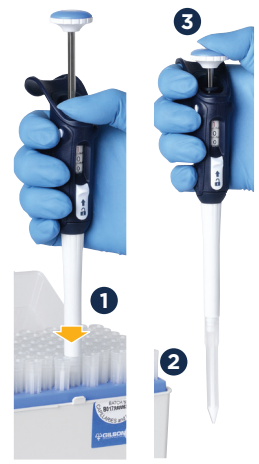
Figure 4 CP fitting on MICROMAN® E